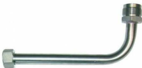
L-shaped connection for hopper (Code: 204003)