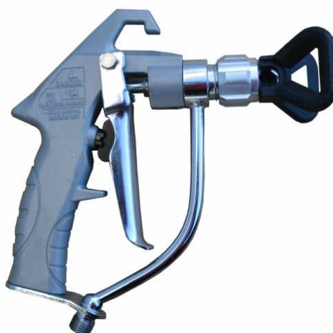
Airless spray gun max. 350 bar (Code: A1227160)