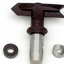
Self-cleaning tip nozzle (all sizes) (Code: SC6xxxx)