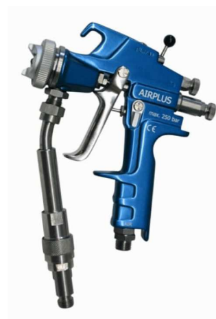
Air-combi spray gun for high pressure max. 250 bar (Code: A1097108)