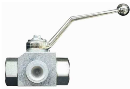
3-way tap for high pressure (Code: 342017)