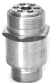
Stainless steel suction valve \frac{3}{4} for MM 101 (Code: A0997144X)