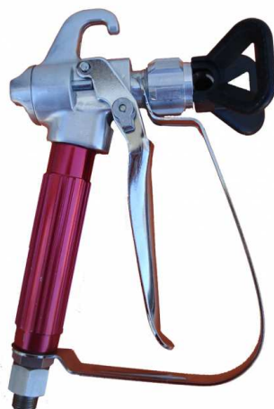
Airless spray gun max. 250 BAR (Code: A1227021)