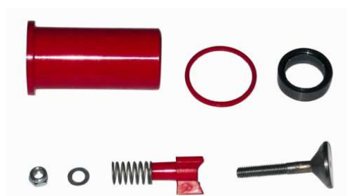
Spare kit for airless suction valve – Housing, gasket, poppet, top and bottom seal, zipper and nut (Code: KT2009)