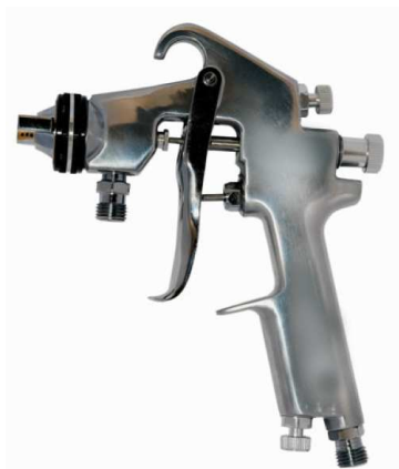
Air-combi spray gun for low pressure max. 7 bar (Code: A122700)