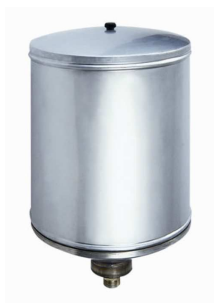
Stainless-steel hopper 25 liters (Code: A0147001)