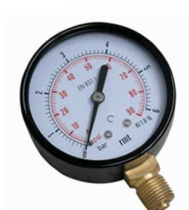
Manometer for low pressure (Code: 102019)