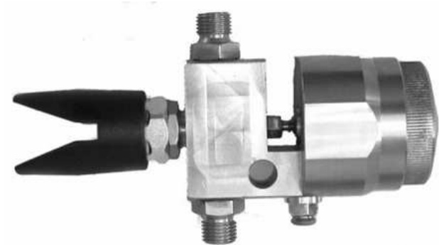
Automatic airless spray gun (Code: A1227024A)