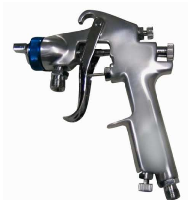
Air-combi spray gun for low pressure max. 7 bar (Code: A1227007)