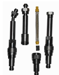
External housing for airless gun filter (Code: PSP6186)