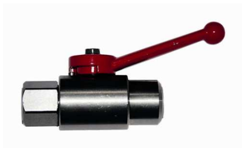
Tap for high pressure - SMALL (Code: 014003)