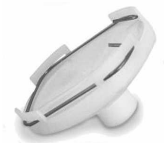
Suction bell 1/2 complete (Code: A1097156)