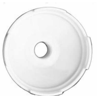
Suction bell ½ simple (Code: A2237079)