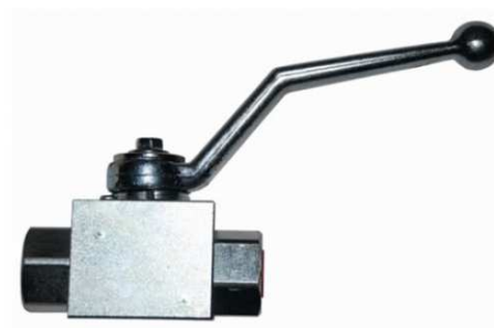
Tap for high pressure - BIG (Code: 014004)