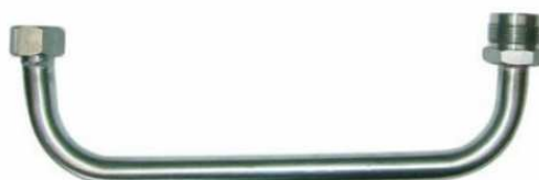
U-shaped connection for hopper (Code: 242002)