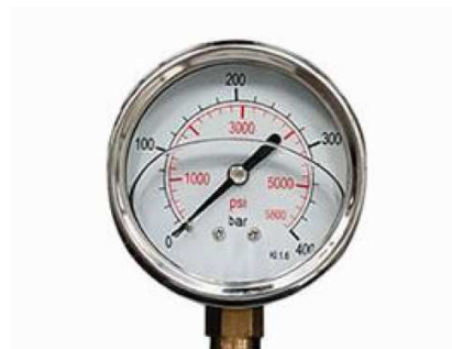
Manometer for high pressure (Code: 012007)