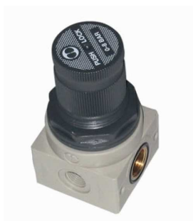
Pressure regulator for MM 101 – DM 2000 S (Code: 092013)