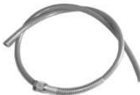
Rilsan recycling pipe complete (Code: A4047258)