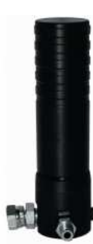
Inline fluid filter for low pressure (Code: A4037053)