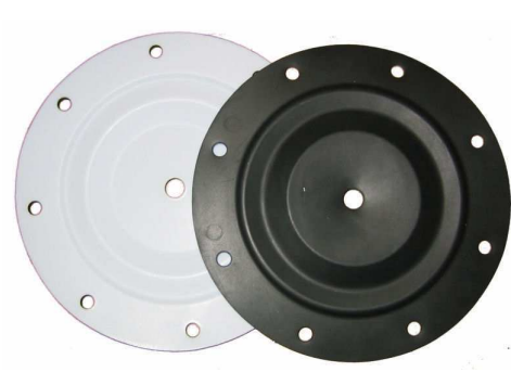
Diaphragm for MM 101 and DM 2000 S (Code: 093005)