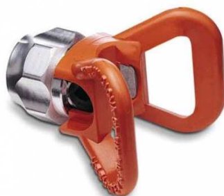
Guard for tip nozzles (Code: A4027110)