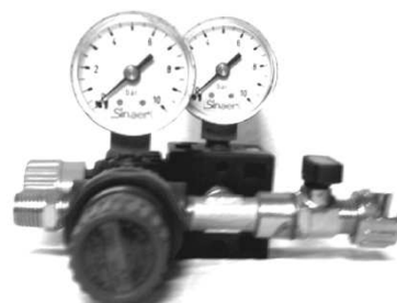
Air regulation group for MM 101 (Code: A0137011)