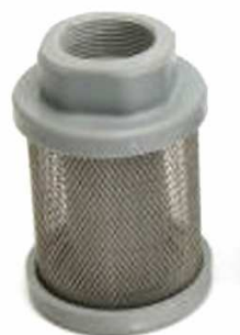
Sieve filter "MIDI" complete (Code: A4027103A)