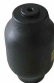
Pressure dampener mod. H 100 - 90 bar (Code: A4027251)

The manufacturer reserves the right to change the appearance and specifications of products without notice.