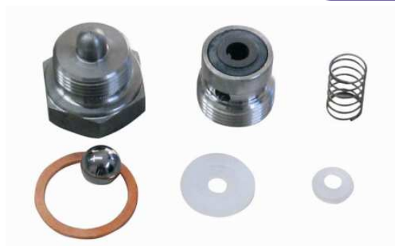
Complete retaining valve for airless (Code: A0197051)