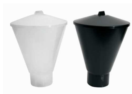
Plastic hopper (6 liters) litri - Available white-transparent and black (Code: A4027013)