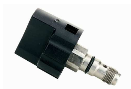
Relief valve for airless (Code: A0197052)