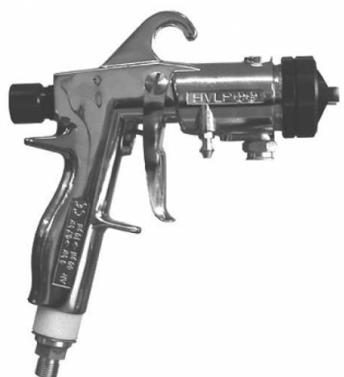
Anti-dusting manual spray gun for HVLP (Code: A1227108)