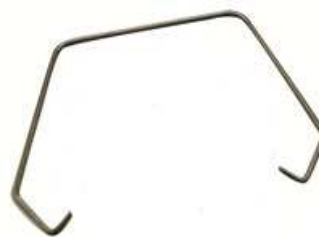
Locking support for filter disc (Code: A2237078)