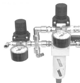
FRL group 1/4 for low pressure (Code: A1097109C)