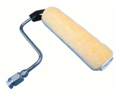
Powered roller for airless (Code: A4037006)