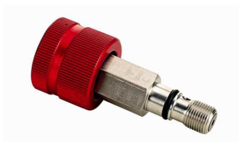
Pressure regulation valve for airless (Code: A0197047)